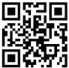
SETUP BEEP ON