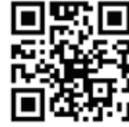
ENABLE ALL 1D CODES