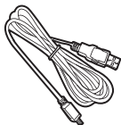
USB Charger Cable